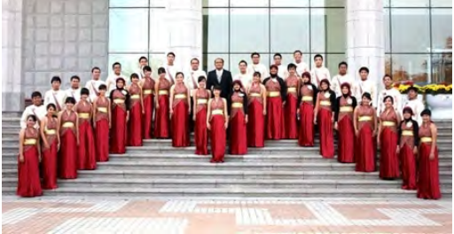
▲ ITS Students Choir

ITS Students Choir recently won in the 3rd Prize "Institucio Pulg-Porret" at Competition no. 4 Folkmusic, 31 Festival International de Musica de Cantoniros, last July 2013 in Spain. On November 2010 they also brought 2 gold medals home from 2010 Busan Choral Festival and Competition in South Korea.