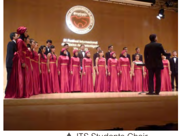
▲ ITS Students Choir